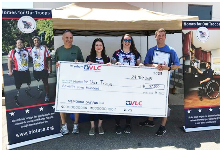
Johnson & Johnson's Raynham Veterans Leadership Council, along with their Live for Life staff, generously donated over $7,500 to HFOT.

Whether it was an individual goal to successfully complete a quick 5K around their campus or a little friendly competition between departments for bragging rights, those who participated had a great time. Either way, it was a nice way to break up a typical lunch break and a reminder to honor those who have served right before the long weekend.