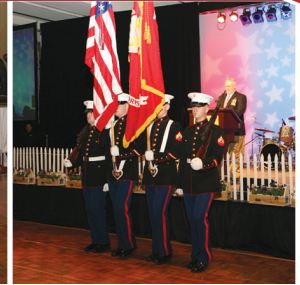
Honor Guard Presentation