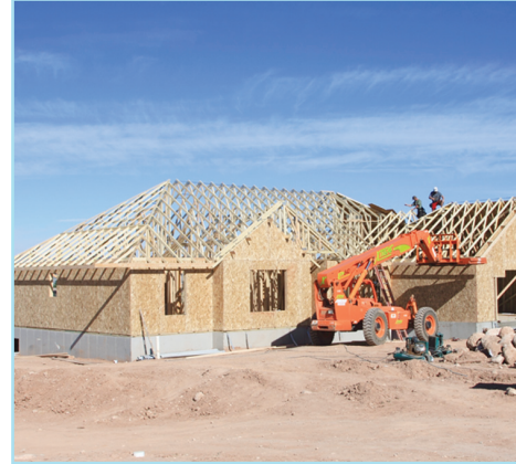
CEDAR CITY, UTAH Completed June 22, 23, & 24, 2009

Thank You to the many volunteers and our builders on each of these projects!