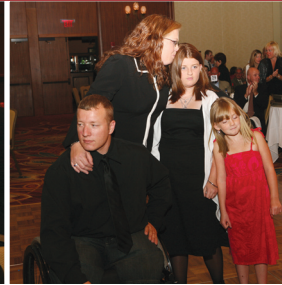
Great News for The Hunts!