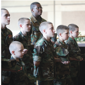
Our Young Marine Escorts