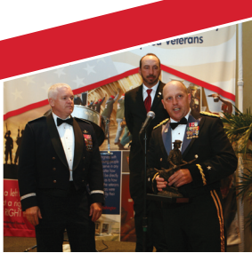
National Guard Presentation