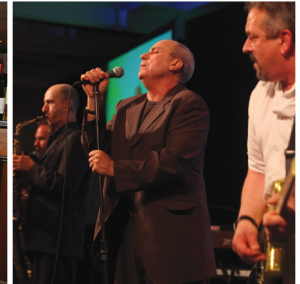
Roomful of Blues!

Our 3rd annual Gala at the Boston Marriott Copley Place was a night we will not soon forget. Memorable presentations, auctions, and dancing to music from Roomful of Blues ensured that a good time was had by all!