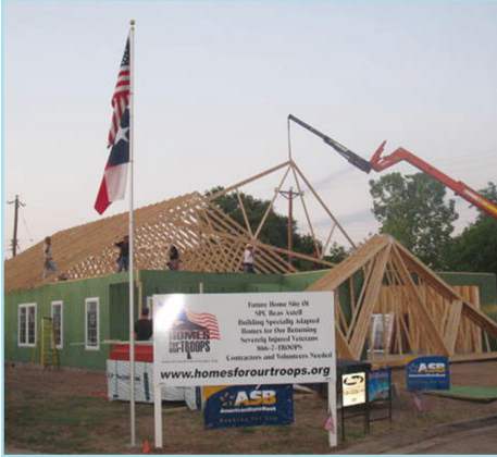
IDALOU, TEXAS Completed May 14, 15, & 16, 2009