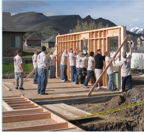
HERRIMAN, UTAH Completed May 5, 6, & 7, 2009