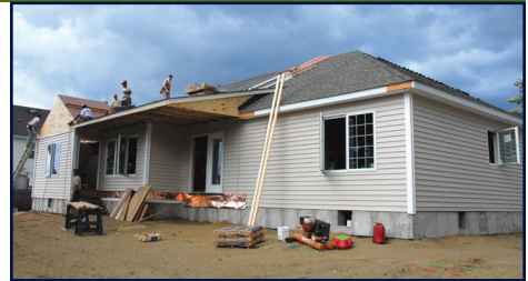
UNION BEACH, NEW JERSEY August 17, 18, & 19, 2009