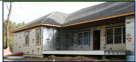
WORTHINGTON, MA August 19, 20 & 21, 2009

HFOT thanks the General Contractor and the many skilled/unskilled volunteers on every one of these projects!