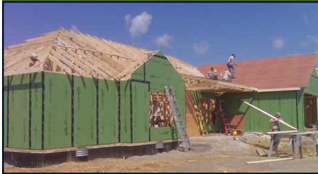
EDDYVILLE, KENTUCKY July 28, 29 & 30, 2009