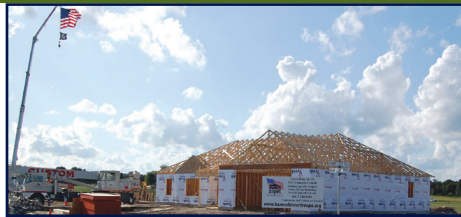
MAHOMET, ILLINOIS August 18, 19 & 20, 2009