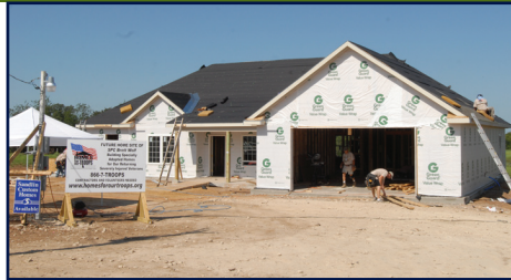
WEATHERFORD, TEXAS August 3, 4, & 5, 2009